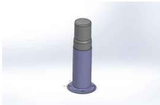
Figure 1 Radome- Mounting Bracket Assembly