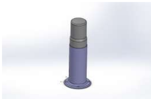
Figure 1 Radome- Mounting Bracket Assembly