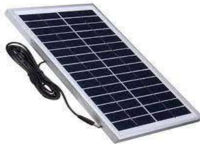
Fig: Solar Panel

The solar panel is having the short-circuit current of 5.8 Amp, the open-circuit voltage of 48.3 V and rated power at 445 Watt/m 2 solar radiation, all measured under STC. It has a dimension of 198.6 x 100.1 x 3.5 cm and weighs 22.5 Kilograms.