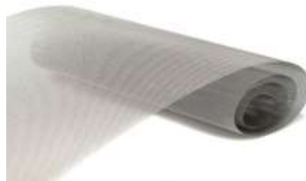
Fig: Wire Mesh

The wire mesh is stainless steel ISO 9001:2000 certified mesh. It has weave wire mesh type having 0.01-25mm aperture. Air can easily pass through it and dries the food with ease.