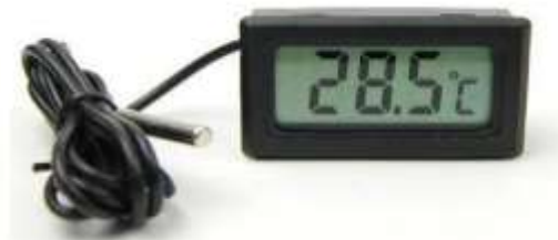
Fig: Temperature Sensor

This temperature sensor has a range of 0-150 C, accuracy <math>\pm 0.1\text{ C}</math> +NTC spread over 0 to 70 C. maximum resistance of 3 ohm and require 12v and 3.5 mAmp of power to operate.