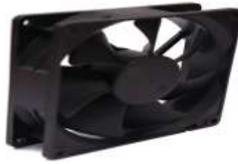
Fig: DC Fan

This Brushless DC Cooling Fan is operating at 12V with a dimension of 90 x 90 mm. It is very quiet and moves approximately at 65 CFM. It has a Dimensions of 90 x 90 x 25mm, Voltage of 12V, Speed of 2400RPM, Air flow of 65 CFM, Current of 0.10A, Cable Length:: 21cm, Sleeve type bearing.