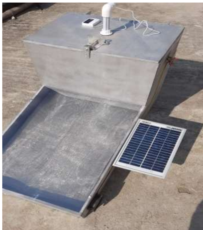
Fig: Actual Model