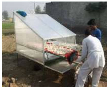
Fig: Different types of Solar Dryer