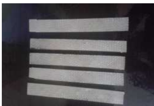
Figure1 The composite samples

Therefore, from the above theory the bending load for each specimen is obtained. The study further performs critical analysis of the reinforced composite materials by employing numerous mechanical testing methods that were based on American Standard Testing Methods (ASTM). The Tensile Test (ASTM D638) is further performed. The composite samples as in Fig1 and that is after performed the tensile test is shown in Fig2. The tensile test values will be tabulated sample is shown in Table.1. The Bending moment values will be tabulated shown in Table2.