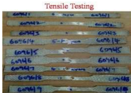
Figure2 Samples that is after performed the tensile test