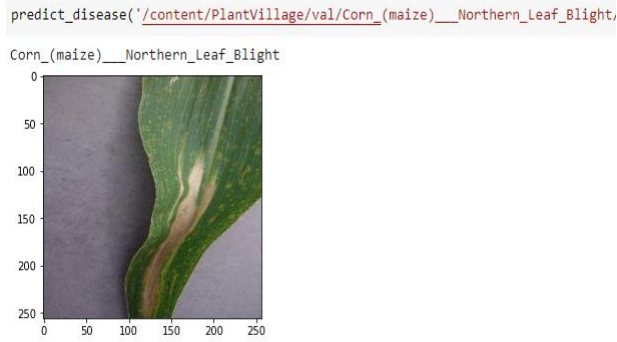
Fig: Screenshot of Corn leaves